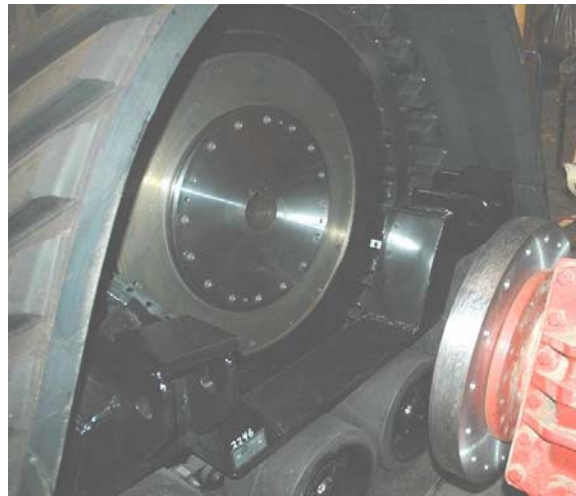
Mount module to adaptor plate