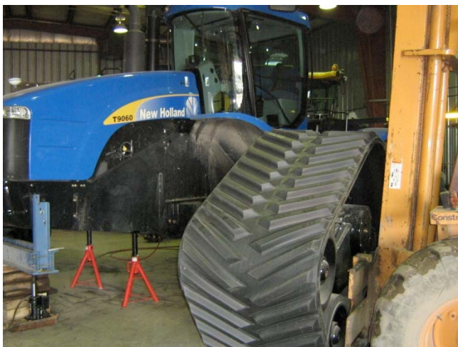
Mount module to adaptor plate