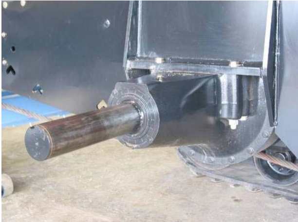
Remove wheel & mounting hub