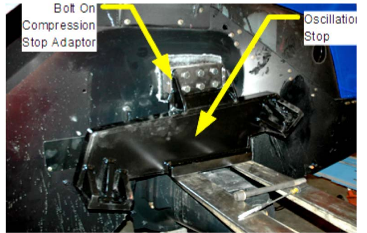
Install oscillation stops on tractor frame