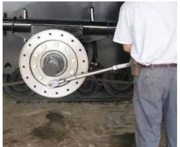
Install adaptor plate to axle hub